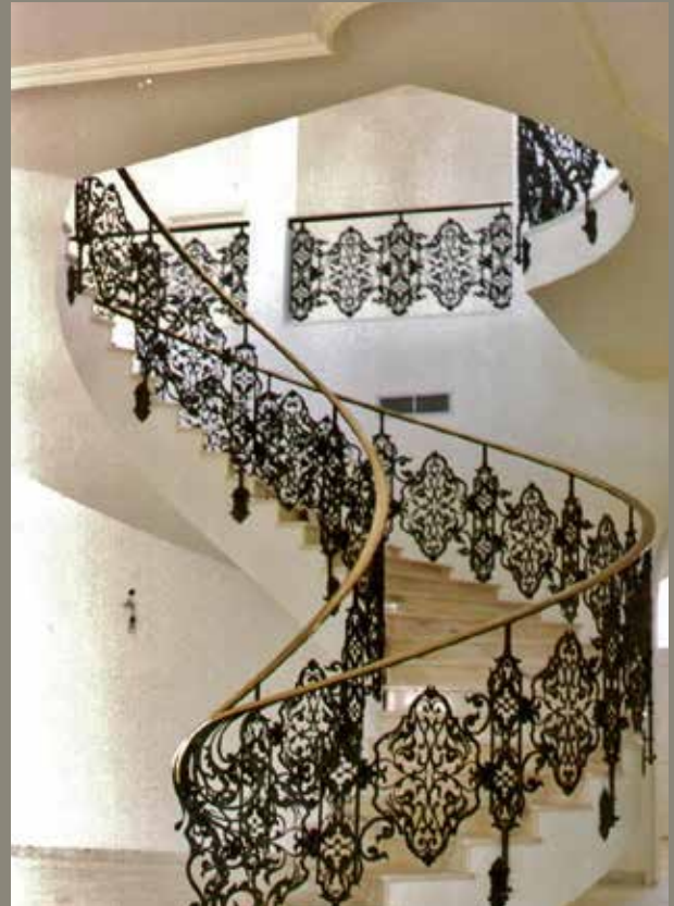
Riyād, private villa

From a stylistic point of view, SAMPIETRO can enhance any type of building with its doors, grilles and railings for stairs and balconies: wonderful shapes that come to life and complement existing constructions. The client's individual character is fully reflected in the final work.