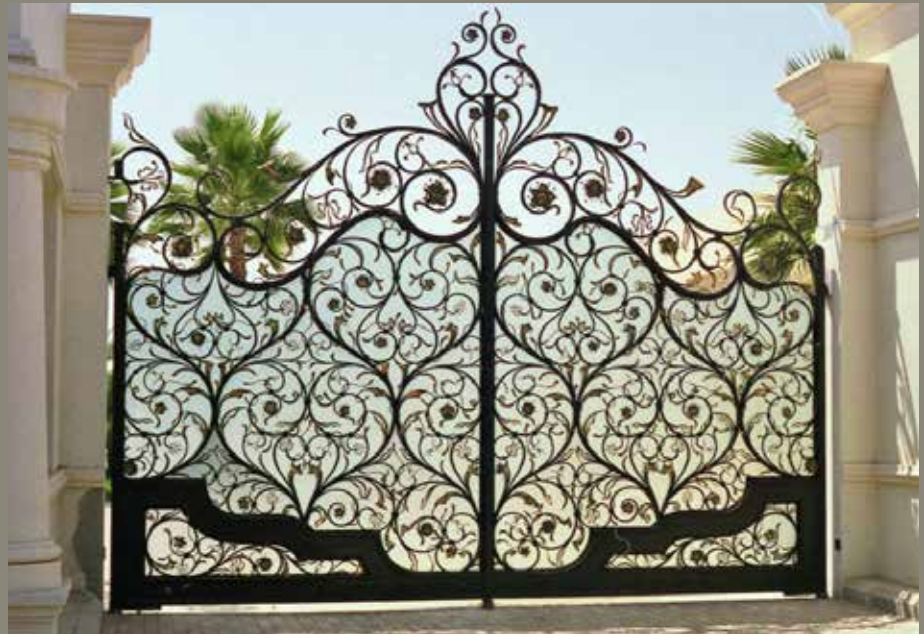
Riyād, private villa

SAMPIETRO is the natural choice for the construction industry because of a series of elements that embellish houses, palaces, villas and public buildings, created specifically to fit in with the style of every building and the client's taste. Gates, gazebos, greenhouses, shelters: the perfect combination of artistic skill, with special attention paid also to regulatory aspects.